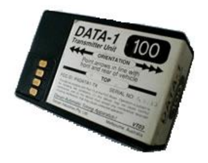
Dorian Micro Data-1 Transmitter Dorian Data-1 Transmitter Dorian Industries provide two types of transmitters for motorsport purposes. Either type can be used at club track days.